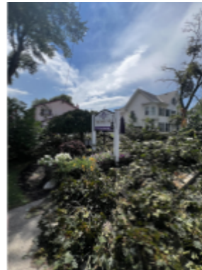
(c) Tree down at Taste-budd's Cafe, Red Hook

The storm lasted only 25 minutes, and poured 0.72 inches of rain on the ground, this equates to about half a gallon of water per square foot. Maximum wind gusts reached 38.3 miles per hour. Within 15 minutes the temperature dropped from 86 to 66 degrees Fahrenheit. Below are the weather data collected from the top of Bard's Stevenson Library by the Center for Environmental Studies and Humanities.