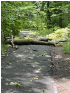
(a) Tree down in a trail at Bard

At around 11:40 am Bard was hit with a damaging storm.