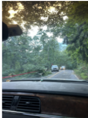
(b) Annandale Road in the afternoon.